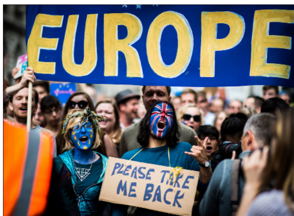
Brexit Protests.

The British 'Brexit' referendum on whether or not to stay in the European Union highlights the perils of democratic and governmental decision making when there is no adequate prior collective strategic thinking and engagement. A strategy gap as vast as this leads to an equally large democracy gap via a dramatic impoverishment of the public